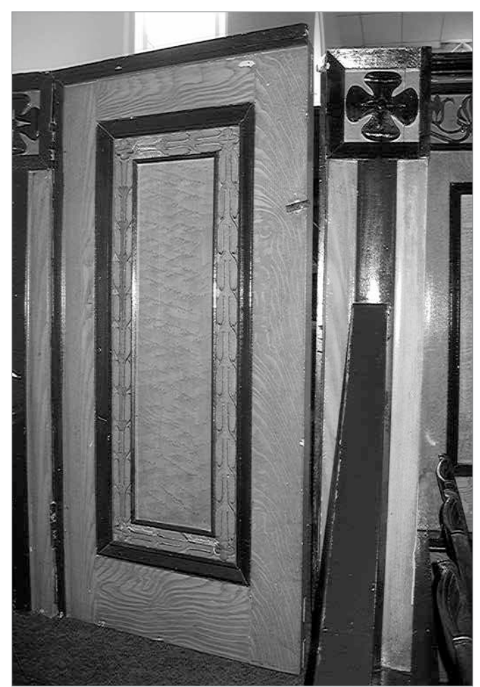
FIG. 4. DESABLE CHURCH OF SCOTLAND, PEI, DOOR INTO HIGH PULPIT. | JACK C. WHYTOCK.