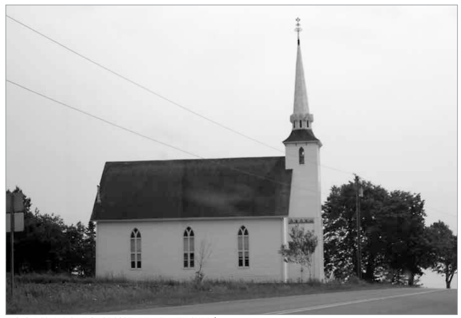
FIG. 2. DESABLE CHURCH OF SCOTLAND, PEI, WITH SPIRE. | JACK C. WHYTOCK.

of a unique liturgical tradition and an ecclesiastical architectural style. After the mid-nineteenth century, it almost ceased in its built form as a whole, except for isolated church enclaves.