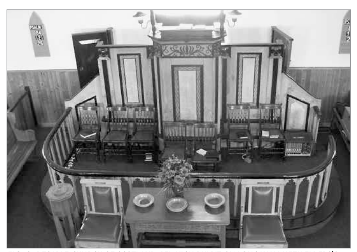
FIG. 3. DESABLE CHURCH OF SCOTLAND, PEI, HIGH PULPIT ON LONG WALL WITH ELDERS'/ PRECENTORS' AREA. | JACK C. WHYTOCK.