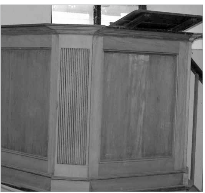
FIG. 12. GLEN LYNDEN PRESBYTERIAN CHURCH, EASTERN CAPE, SOUTH AFRICA, 1828, HIGH PULPIT DETAIL.

chimneys—but nothing that diminishes the overall theme of continuity. Its date, 1852-1855, places toward the end of the three-hundred-year Scottish continuum of post-Reformation buildings.