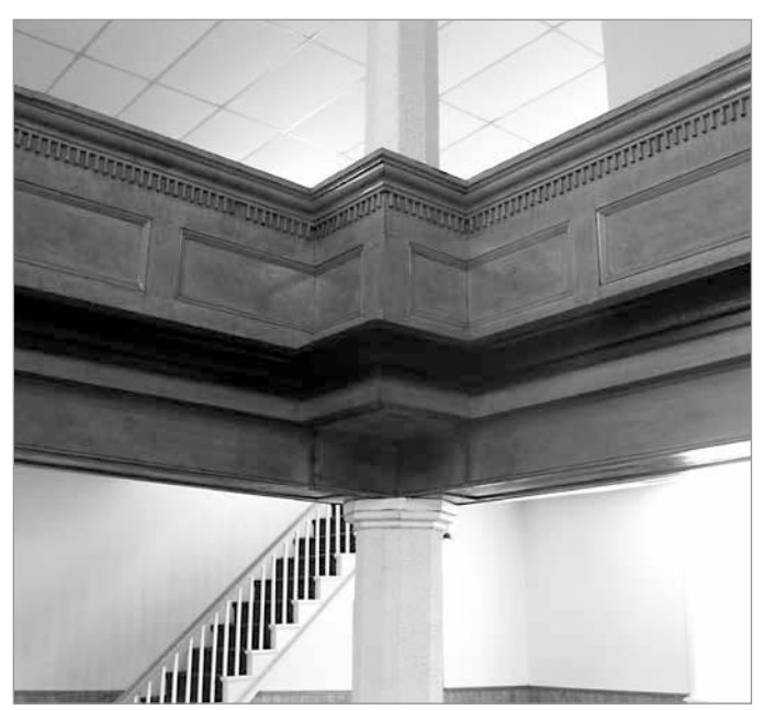
FIG. 9. DESABLE CHURCH OF SCOTLAND, PEI, GALLERY DENTILATION AND BOX FOR CHIMNEY. | JACK C. WHYTOCK.