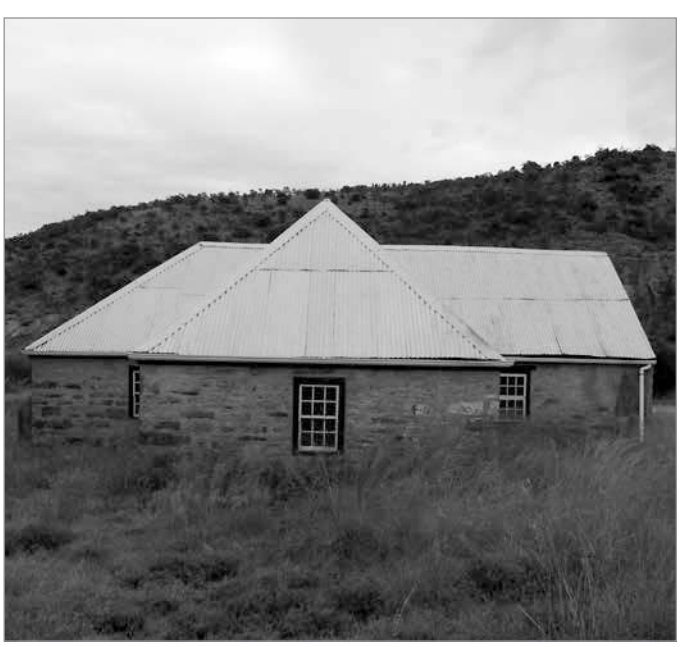
FIG. 10. GLEN LYNDEN PRESBYTERIAN CHURCH, EASTERN CAPE, SOUTH AFRICA, 1828, T PLAN. J JACK C. WHYTOCK.

distinction. The purpose of this paper is not to fully analyze all the reasons for the liturgical changes that were taking place in Presbyterianism in the second half of the nineteenth century and early twentieth century. This would be a whole other paper on liturgics and spacial usage.<sup>11</sup>