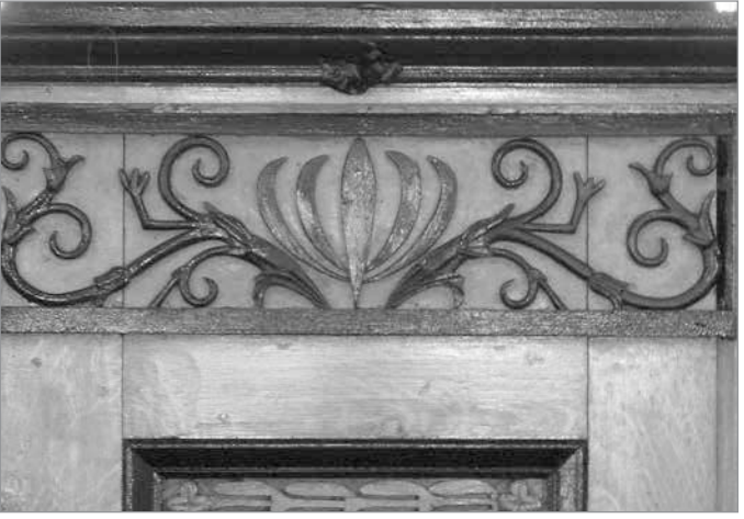
FIG. 5. DESABLE CHURCH OF SCOTLAND, PEI, CARVING DETAIL ON FRONT OF HIGH PULPIT. | JACK C. WHYTOCK.