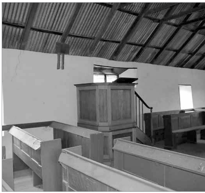
FIG. 11. GLEN LYNDEN PRESBYTERIAN CHURCH, EASTERN CAPE, SOUTH AFRICA, 1828, HIGH PULPIT ON LONG WALL, THREE-SIDED SEATING ARRANGEMENT. | JACK C. WHYTOCK.