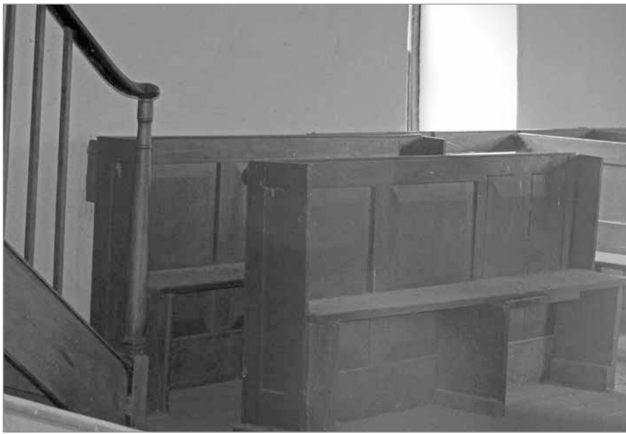
FIG. 13. GLEN LYNDEN PRESBYTERIAN CHURCH, EASTERN CAPE, SOUTH AFRICA, 1828, ELDERS' BENCHES.

season here had twelve sittings to accommodate the approximately nine hundred communicants.