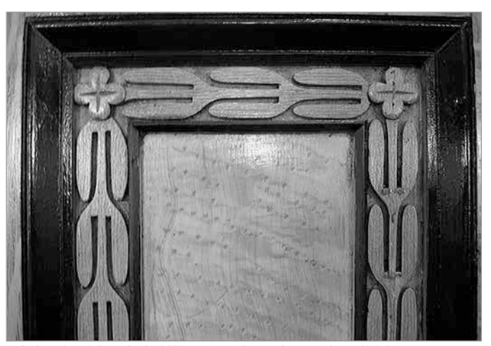
FIG. 6. DESABLE CHURCH OF SCOTLAND, PEI, CARVING DETAIL ON FRONT OF HIGH PULPIT. | JACK C. WHYTOCK.