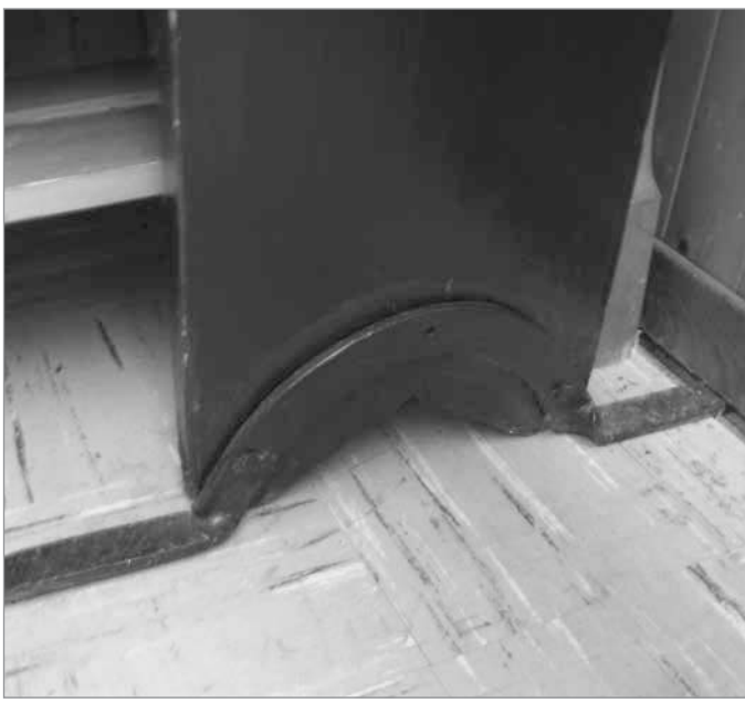
FIG. 8. DESABLE CHURCH OF SCOTLAND, PEI, STABILIZING BAR FOR LONG COMMUNION TABLE. | JACK C. WHYTOCK.

large numbers. If the service was held in the church and the crowd overflowed to the outside, then the windows would be removed for the people to hear.8